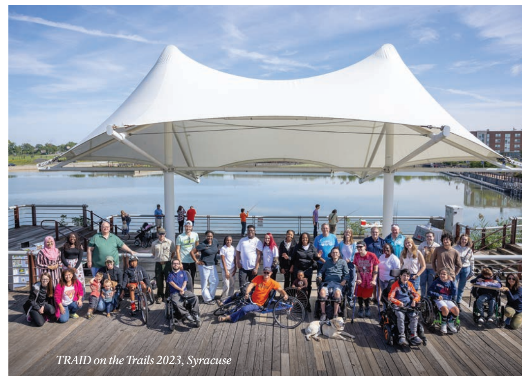
TRAID on the Trails 2023, Syracuse