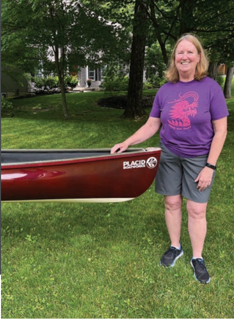
Thanks to a generous donation of a hand-crafted Oseetah canoe by Placid Boatworks, we raised $11,000 to fund initiatives along the NYS Canalway Water Trail.