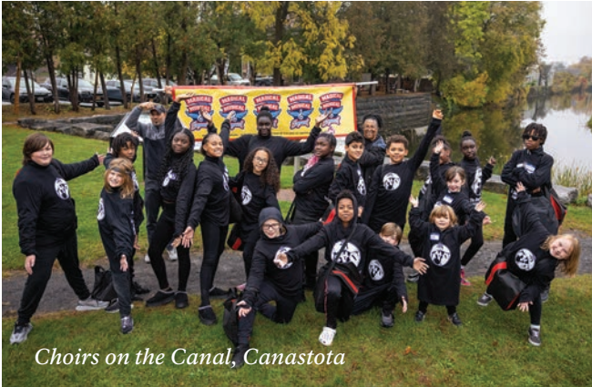
Choirs on the Canal, Canastota

— Glenn Cerosaletti, Rotary Club of Rochester-Southwest