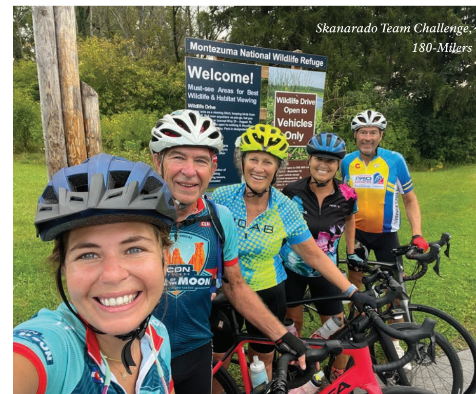
Skandarado Team Challenge, 180-Milers

Cycling continues to be the most popular way to log miles. Sixty-four percent of finishers reported cycling the trail, followed by 22% who walked or hiked.