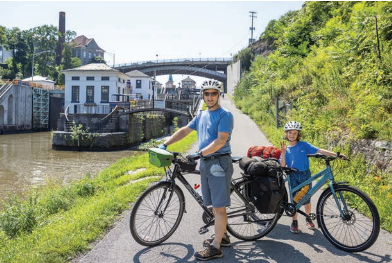
We were proud to once again be the Heritage Sponsor for Cycle the Erie Canal , hosted by Parks & Trails New York. The 8-day cross-canal bike tour drew 775 participants from 42 states and Canada.