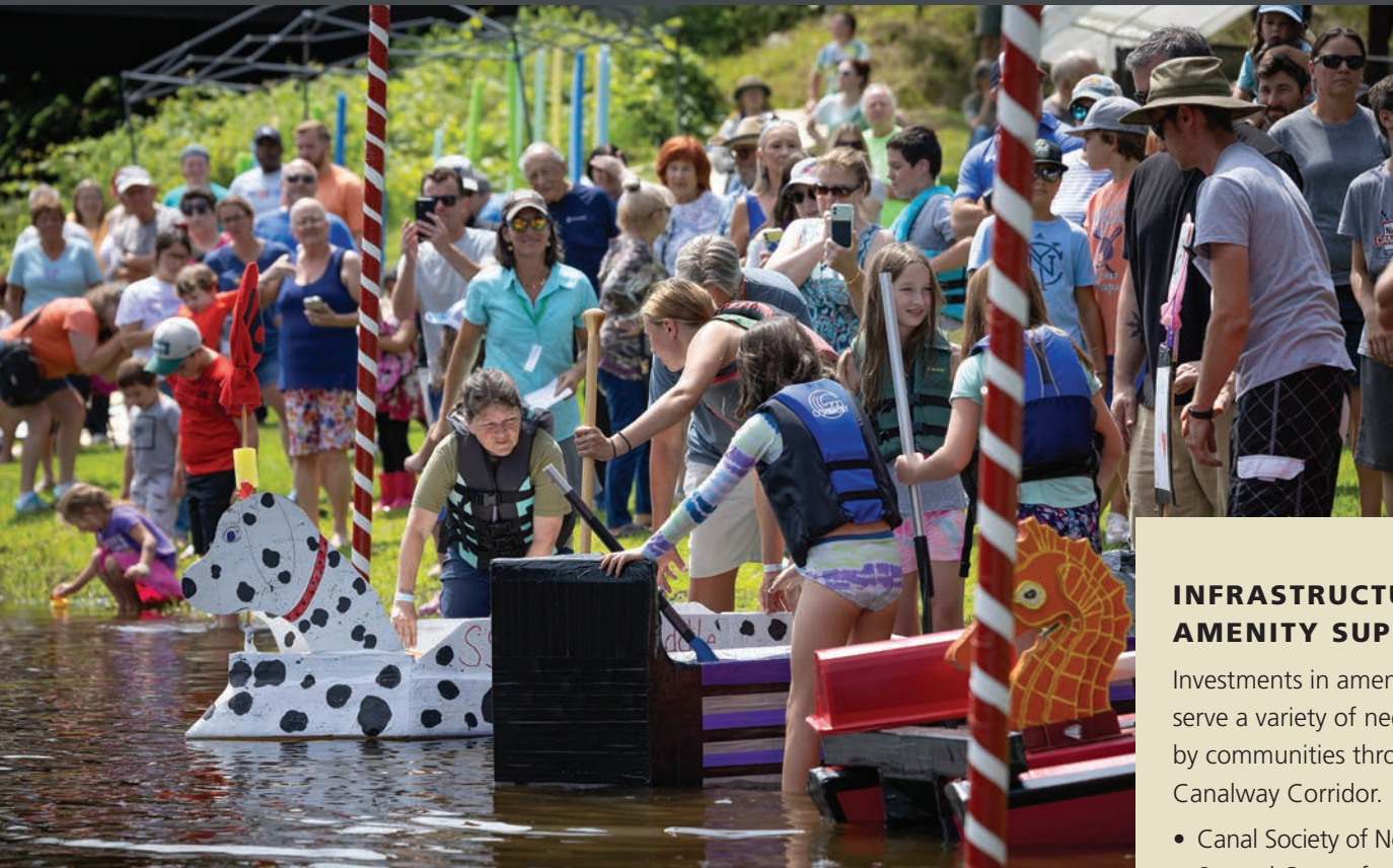
17th Annual Cardboard Boat Races, Schuylerville

NYS Canal System Tourism Infrastructure and Event Grants totaling $190,000 offered jointly by the Erie Canalway National Heritage Corridor and the New York State Canal Corporation supported seven tourism infrastructure and amenity improvements and 35 events that drew 86,545 people to the canals this year. Additional public and private sources matched our investment by two to one. These investments improve local quality of life, enhance the visitor experience, and generate millions of dollars annually in economic impact for canal communities.