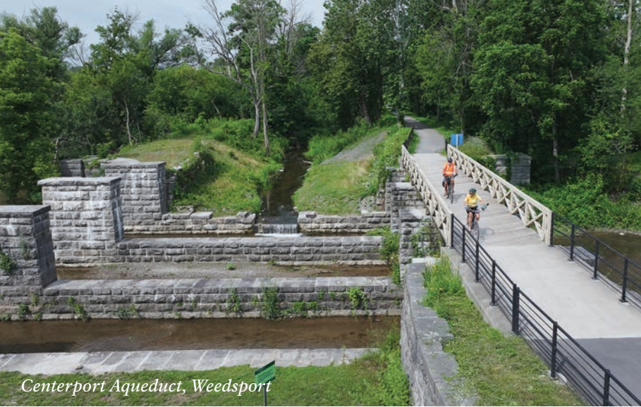
Centerport Aqueduct, Weedsport

The most viewed pages of our website include cycling, boating, paddling, maps, and itineraries, with more than 200,000 views in 2023. We distributed 65,000 Erie Canalway Map & Guides and 19,500 Erie Canalway Calendars to convey the distinctive sense of place and best ways to experience the Canalway Corridor. We are grateful to our dedicated network of more than 170 visitor centers, historic sites, and libraries who ensure that these materials reach residents and visitors each year.