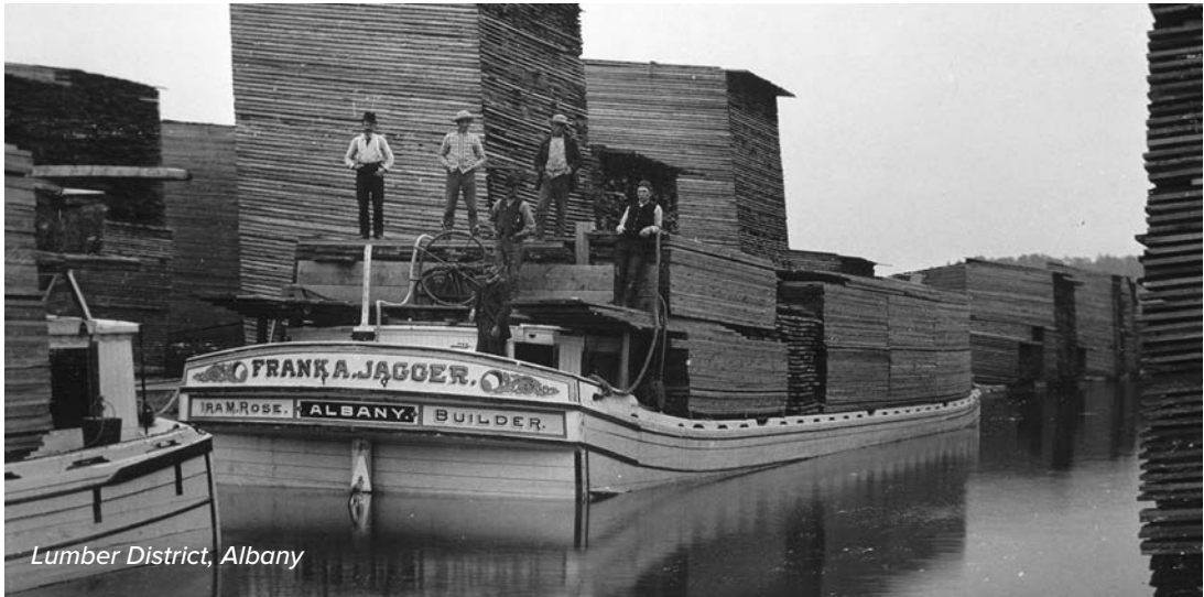
Albany Institute of History & Art

New York has long been a state of big ideas and the kind of can-do spirit that turns them into reality. Credit for this entrepreneurial attitude is due, in part, to construction of the Erie Canal. Built between 1817 and 1825, the original Erie Canal traversed 363 miles from Albany to Buffalo. It was the longest artificial waterway and the greatest public works project in North America.