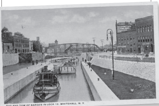
Lock 12, Whitehall, 1917

The structures and channels of the Erie, Champlain, Oswego, and Cayuga-Seneca canals operate today largely as they did when the canals were enlarged between 1905 and 1918. Renamed the NYS Barge Canal to reflect commercial shipping, the word “barge” is used infrequently today and the canals are now collectively known as the NYS Canal System.