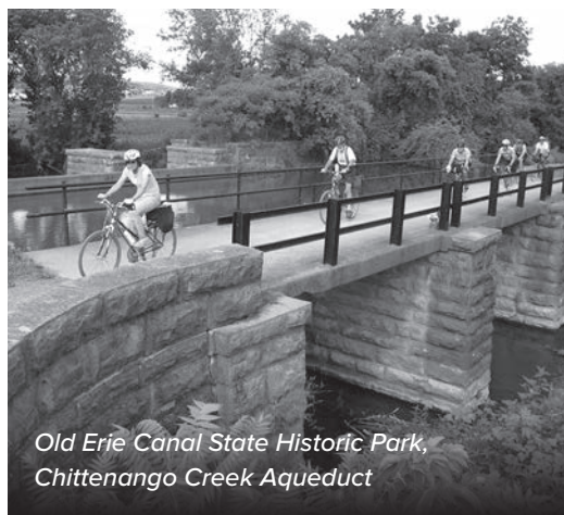
Old Erie Canal State Historic Park, Chittenango Creek Aqueduct

FOR MORE INFORMATION about locations, fees, hours, and facilities, visit parks.ny.gov .