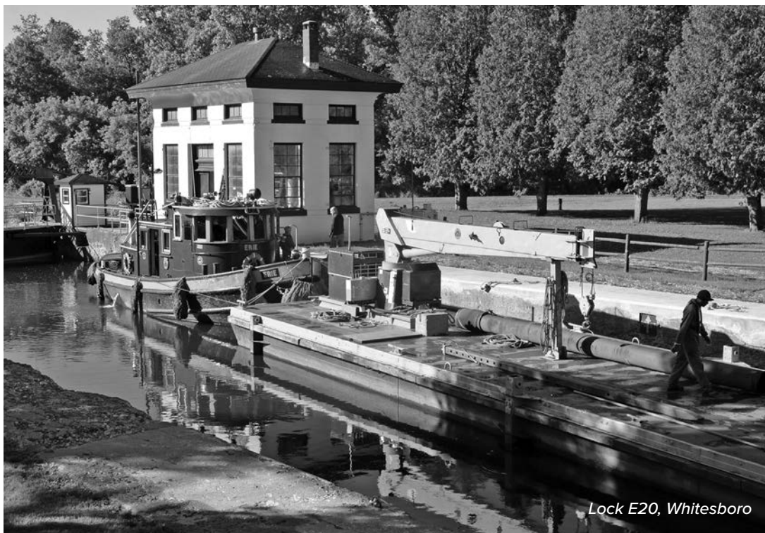
Lock E20, Whitesboro