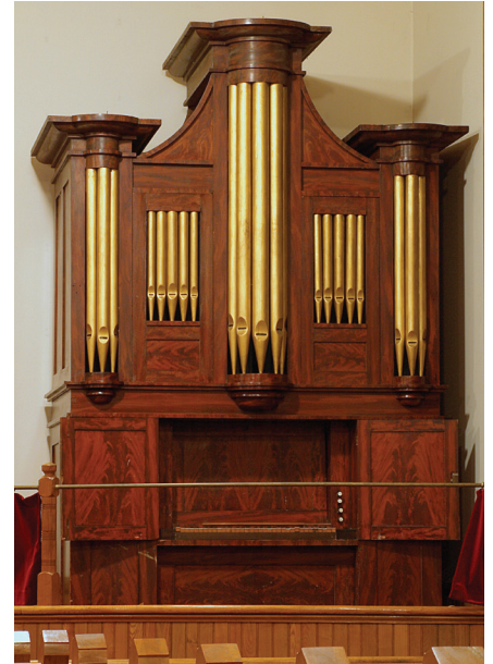
Alvinza Andrews Organ Nr. 1 (1836), Scot Huntington

Using your answers from the previous page, write the names of the waterways that the boats which carried the pipe organs would have traveled between the Andrews Organ factory in Utica and the churches in the cities that purchased pipe organs.