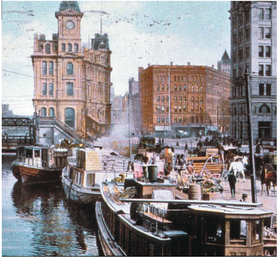
Photo: Postcard image of canal basin in Clinton Square, Syracuse, ca. 1905

Erie Canalway National Heritage Corridor Preservation and Management Plan